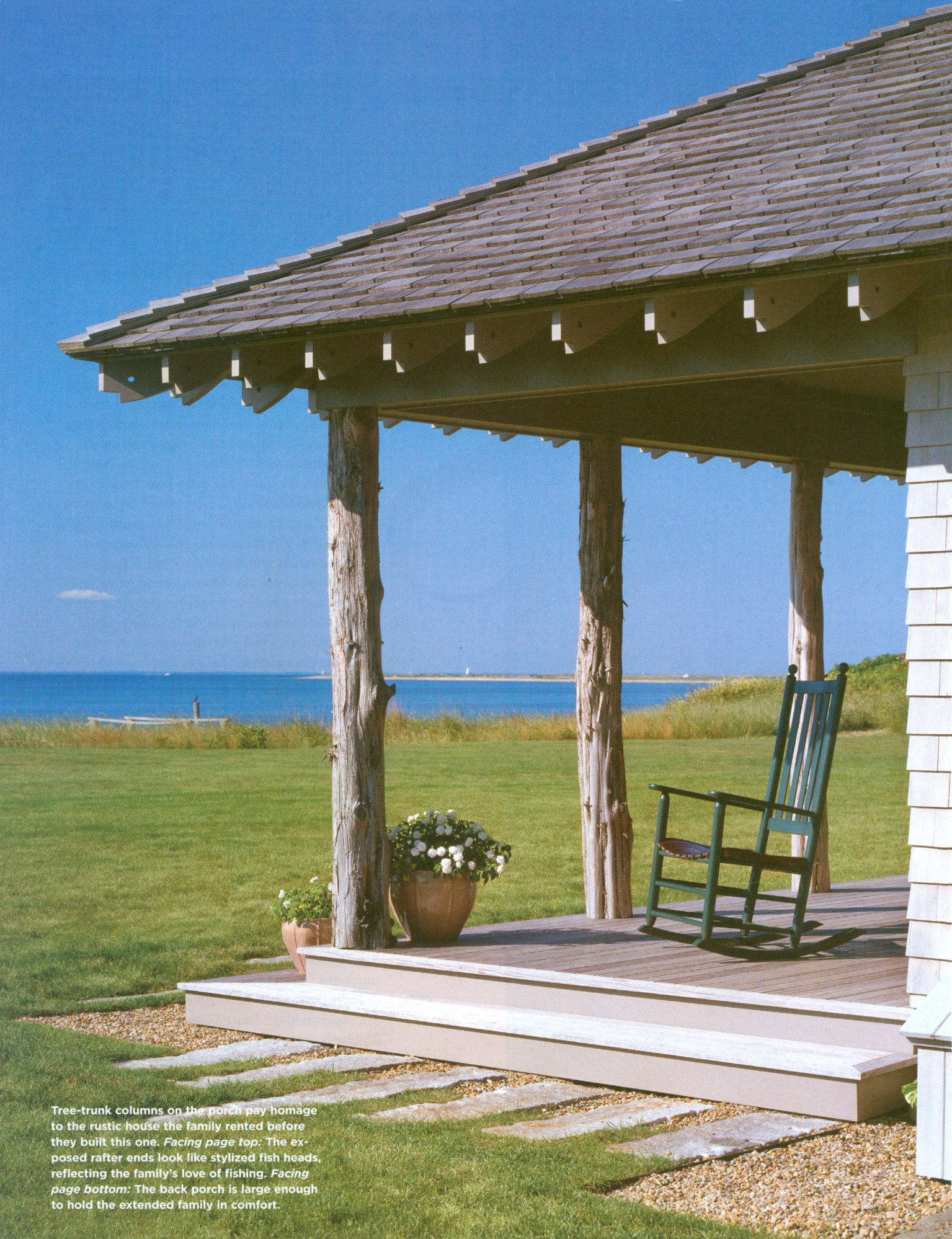
Tree-trunk columns on the porch pay homage to the rustic house the family rented before they built this one. Facing page top: The exposed rafter ends look like stylized fish heads, reflecting the family's love of fishing. Facing page bottom: The back porch is large enough to hold the extended family in comfort.