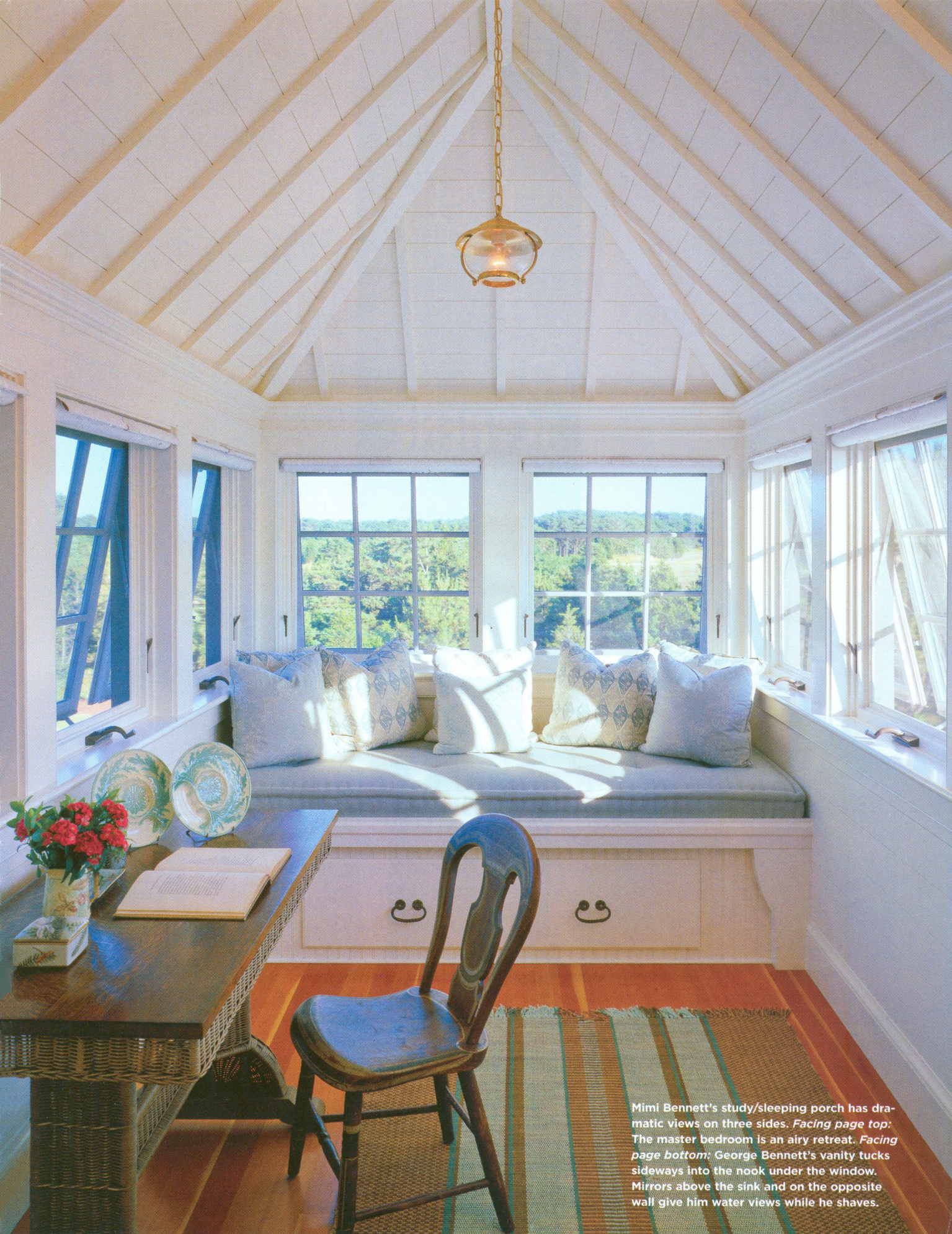
Mimi Bennett's study/sleeping porch has dramatic views on three sides. Facing page top: The master bedroom is an airy retreat. Facing page bottom: George Bennett's vanity tucks sideways into the nook under the window. Mirrors above the sink and on the opposite wall give him water views while he shaves.